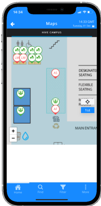
Figure 3 - RX Mobile Office Floor Map

Other standard ResourceXpress features aimed at combatting Covid-19 and assisting a safe return to work: