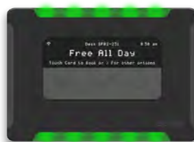
Free all day