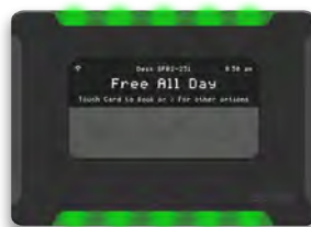
Free all day